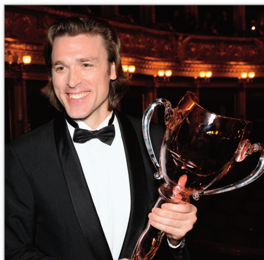
Thalia Award