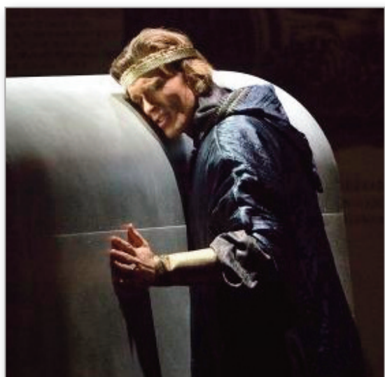
Hamlet

Opera Hamlet is not played so often ... how was your first impression, when you got closer to the role?